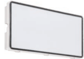
With Opal pad (FTL -PAD-OPAL)