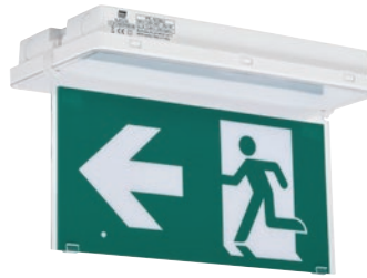
Ceiling Mount Recessed Mount (via FTL-REC-SET)