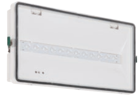
Wall Mount & Ceiling Mount Recessed Mount (via FTL-REC-SET)